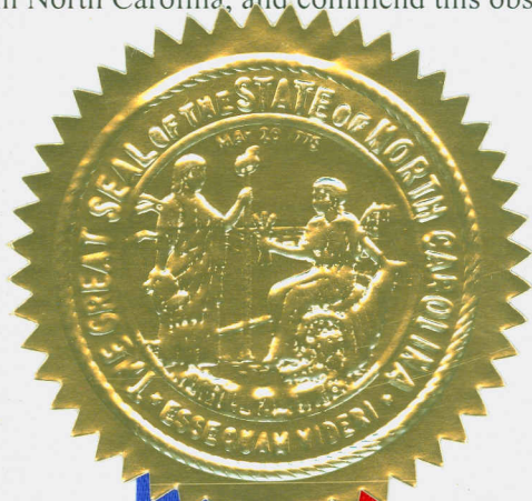
BEVERLY EAVES PERDUE

NOW, THEREFORE, I, BEVERLY EAVES PERDUE, Governor of the State of North Carolina, do hereby proclaim May 2009, as " MULTIPLE CHEMICAL SENSITIVITIES AWARENESS MONTH " and May 12, 2009 as " MULTIPLE CHEMICAL SENSITIVITIES AWARENESS DAY " in North Carolina, and commend this observance to all our citizens.